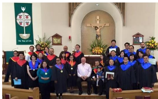
MSI's 6 th Commencement Exercises taken on Aug. 22, 2015, the Queenship of the Blessed Virgin Mary.